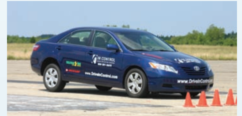
Crash prevention training reduces the likelihood of first-year driver crashes by 70%.

Why have so many European countries surpassed the U.S. when it comes to driving safety? Because they focus on driver training and have made closed-course, hands-on crash prevention training mandatory.